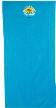
Last Gasp of Summer Towel