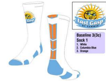
Last Gasp of Summer Sock