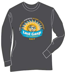
Championship Technical T-Shirt Unisex

Memorialize your swim with a t-shirt, sweatshirt or other merchandise seen below. Apparel and merchandise can be ordered during registration.