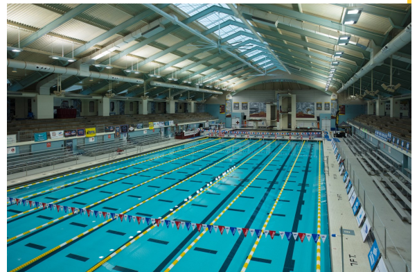
National meet venue