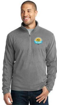
Fleece 1/4 Zip Sweatshirt Unisex