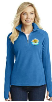
Fleece 1/4 Zip Sweatshirt Womens