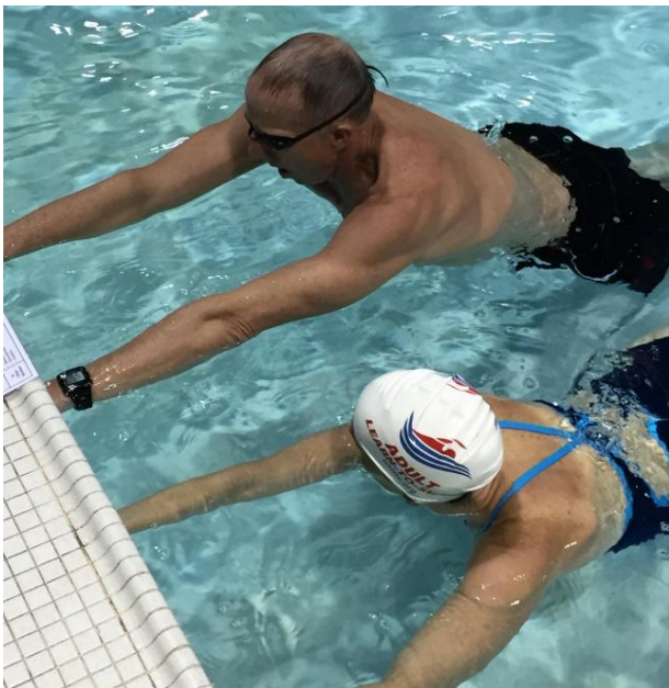
Teaching the 'Front Flutter Kick' on the wall