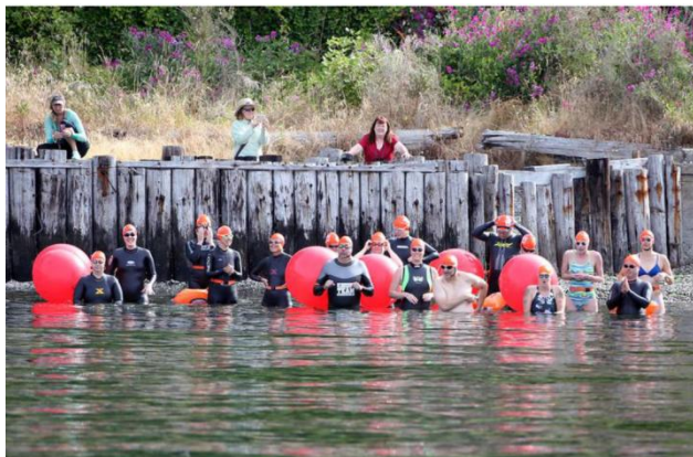
Swim Defiance 3K race competitors in-water start on the Vashon side.

On Sunday, June 21, 2015, 46 courageous and indomitable swimmers braved the 54° waters of the Puget Sound as they recreated that historic open water race swam by thirteen hardy souls in 1926!