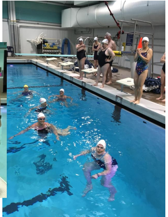
And we had to tread water AND swim 25 yards as part of the final test!