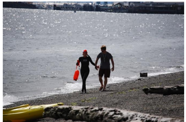
Well, that water certainly didn't feel as smooth as it looks now!!!