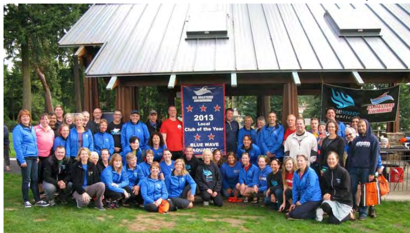
BWAQ members gather at the Last Gasp of Summer .

Great clubs provide strength to United States Masters Swimming. The Club of the Year Award seeks to recognize clubs that exemplify the core objectives of USMS: to Serve, Educate, and Build the membership.