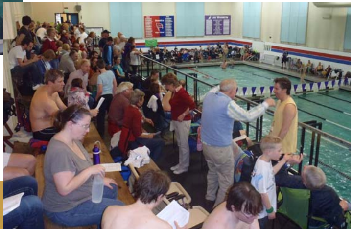
With nearly 200 competitors plus supporters, the balcony at Juanita Aquatic Center was a crowded place.