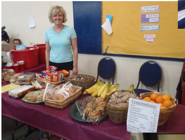
A cheerful volunteer works the well-stocked concession table at the Juanita Aquatic Center.